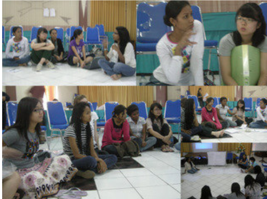
During the analysis of the women's programmes

While doing the analysis the group collectively identified some of the challenges to promote women's concerns within SCMs that needs to be addressed seriously.