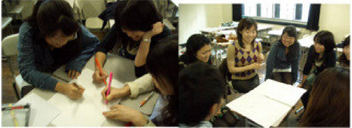
brainstorming about what interests wo/men have each other