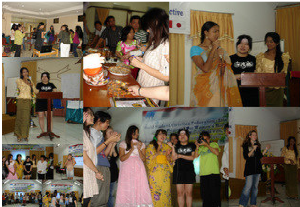
SCM women celebrating life of the diverse culture of Asia and Pacific during the solidarity night