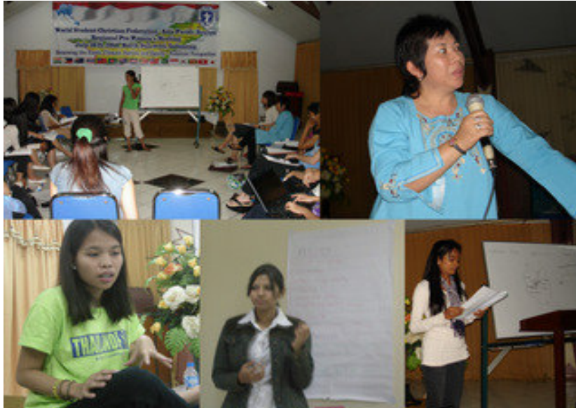
National Women's Programmes report sharing

The delegates shared the programme activities on women's concerns initiated in their local SCMs. (please find the detailed reports by the delegates in appendix) . After the sharing of SCM Australia, Bangladesh, Cambodia, Hong Kong and Indonesia the meeting was concluded for the day.