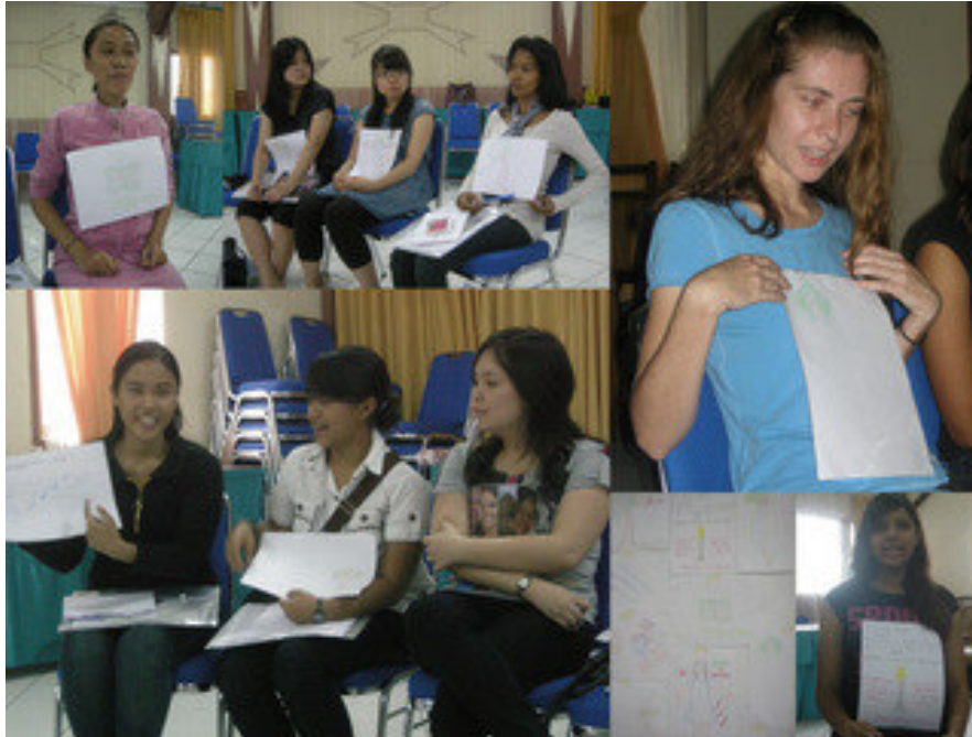
Women introducing to the group by sharing their reflection relating the symbols they identified with