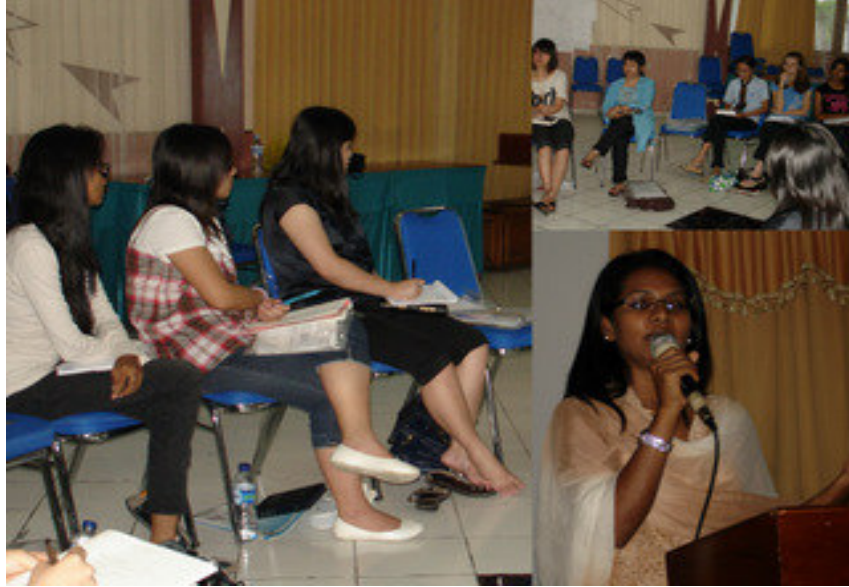
Welcome and Introduction of the pre women's meeting