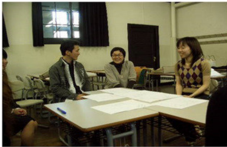
Sharing her work-life experience (left) male senior friend, (center) female senior friend, (right) facilitator, who is female senior friend