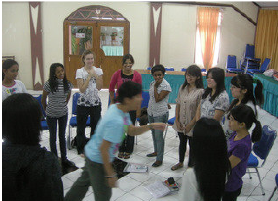
Community games in between the sessions