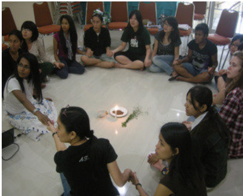
During a closing worship