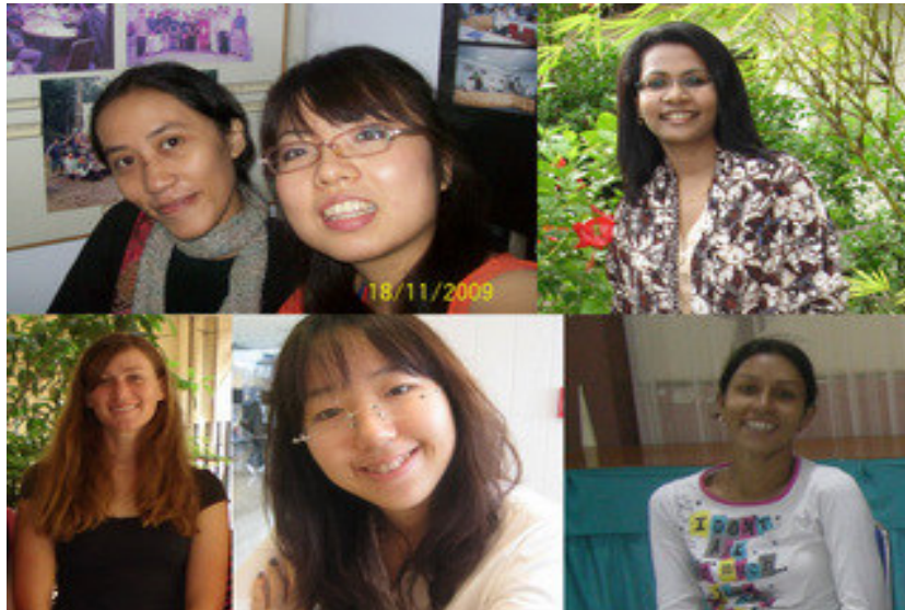
RWC members for 2010-2012