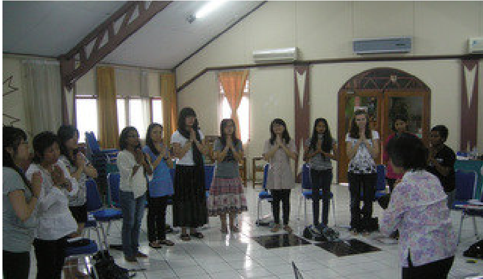
Concluding the Bible study by saying the song prayer together